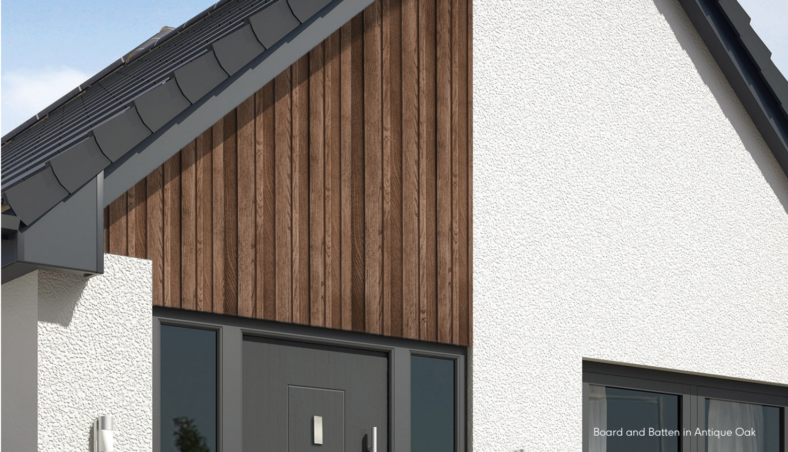
Board and Batten in Antique Oak