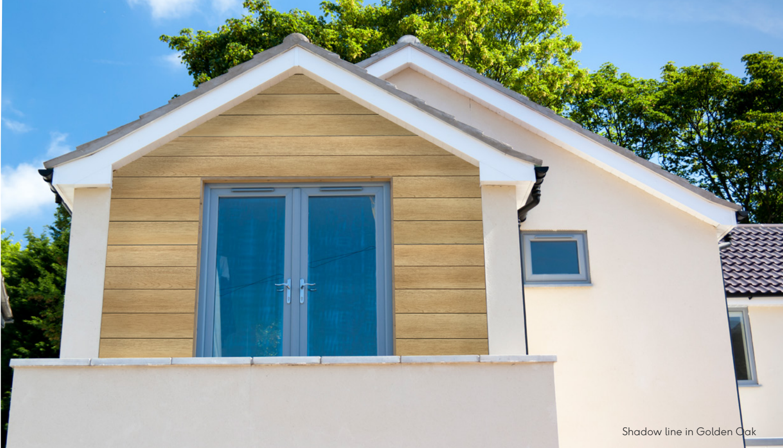
Shadow line in Golden Oak