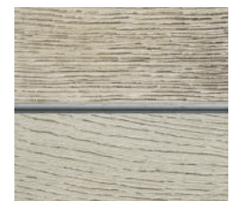
Smoked Oak: MCL360D