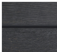
Burnt Cedar: MCL360R