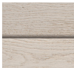
Lined Oak: MCL360L

When fitted in accordance to our install guides