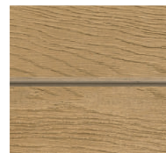
Golden Oak: MCL360G