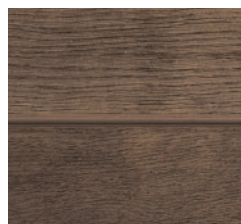
Antique Oak: MCL360A